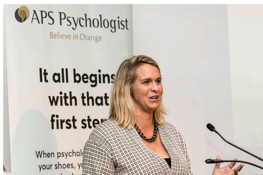
Olympian Libby Trickett speaks at the APS event Why I Believe in Change

The APS also supports the new generation of psychologists with free or reduced price APS membership for students and a range of events for students and early career psychologists. Our information hubs Student HQ and the APS Early Career Hub provide guidance for those seeking to navigate their way through education and training to full registration as a psychologist.