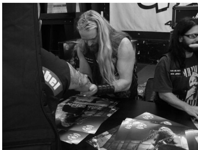
Figure 5. Zakk Wylde signing Chopper's arm

This tour also takes us across the boundary between public and private, from Chopper's inner thoughts and memories to public displays of identity and community (Morgan & Pritchard, 2005). A given tattoo of an event takes on meaning in the context of other tattoos; when combined, these tattoos create a history of participation in concerns and efforts to meet community leaders (band members). This is the bodyscape in action. Tattoos become central props to Chopper's identity and the