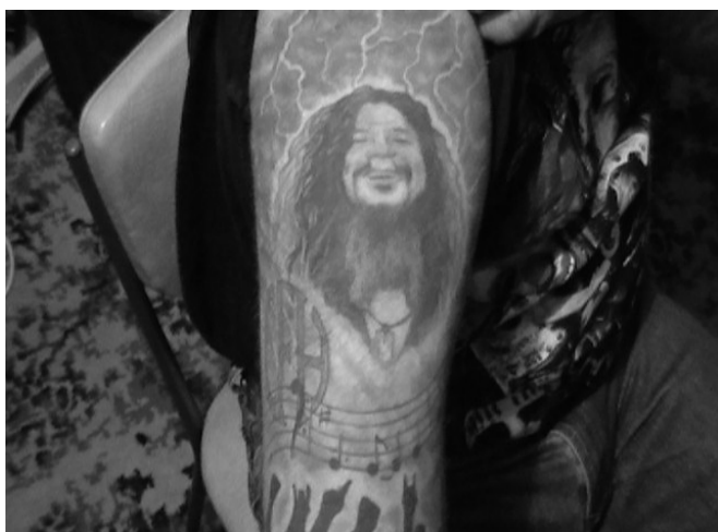
Figure 1. Chopper's upper right arm