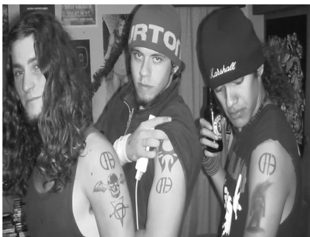
Figure 6. Harvest members' CFH tattoos

social situation represents a performance of identity that differs from Chopper's originally stated function of the tour. Chopper is no longer educating others, but is instead sharing community affiliations and the shared admiration of community leaders, while at the same time establishing himself as a more influential and distinctive member of the group.