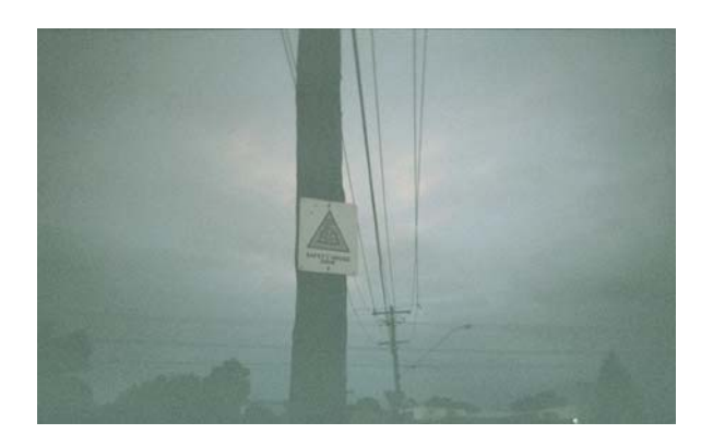
Photograph 2 . Safety House zone.