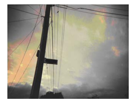
Photograph 3 . My court sign.

It's kinda got all of the clouds and everything... it's always very foggy in the morning and stuff. I love it, it's mystical. I'll look out my bedroom in the morning and I'll just see all these clouds and it's so pretty. I love it. So I pictured the court sign and the clouds...I wake up and see the fog. I walk to school. I used to go to [name of school] and um I'd walk to school in the morning and it would feel like I was walking in the clouds. It was so nice.