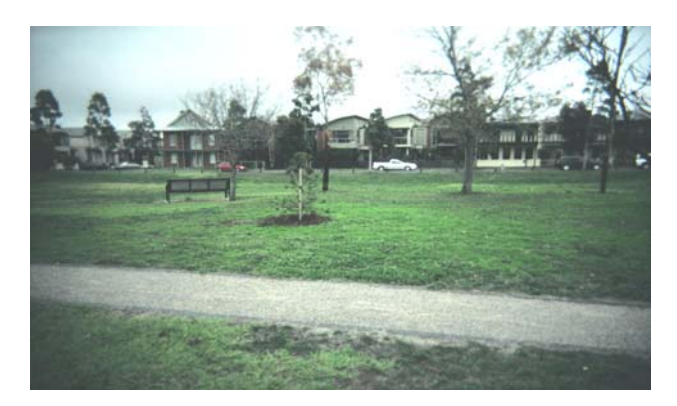
Photograph 1 . The park.

within the neighbourhood were raised during the discussions. Sometimes the neighbourhood was perceived as a safe place for activities, such as playing in the park. John, a participant from the specialist school, in describing the park shown in Photograph 1, revealed that ".... It's pretty safe there... I have to tell mum when I get back. .. Um she worries that I might fall over, stuff like that."